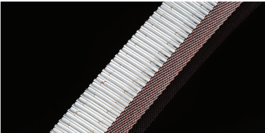
Typical aluminum welding applications (from top): electronic package, an aluminum tab on a prismatic battery can, and aerospace honeycomb.

metal melts at around 660°C, this oxide layer melts above 2000°C.