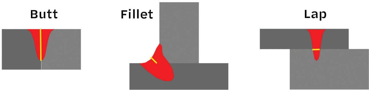
Different weld joint designs are highlighted.