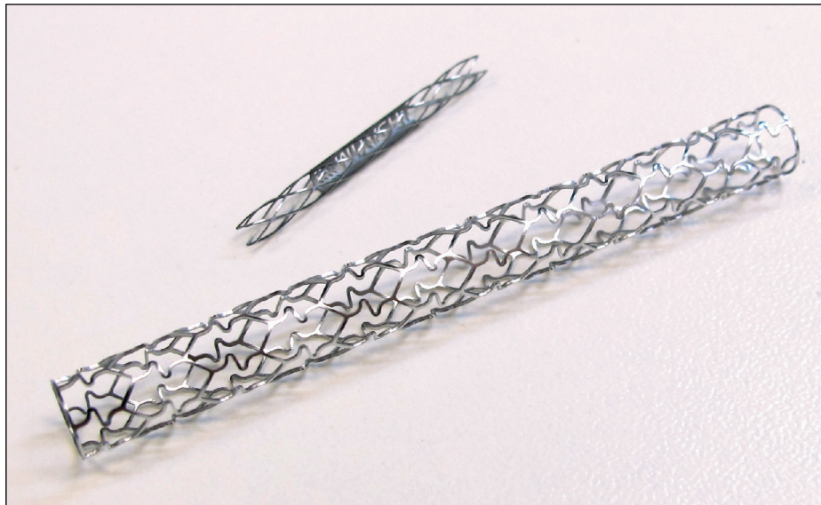
Figure 1 – Laser cut stents

Stents and hypodermic tubes (hypotubes) are used in countless applications and the demand is growing rapidly in response to the continued demand of stent applications and growth of minimally invasive surgery. The sheer number and diversity of devices is rapidly increasing – and with it the demand for more and more laser cut stents, flexible tubing, cannulas and micro cannulas, needles, biopsy devices, and other minimally invasive tools. Figure 1 shows examples that represent common features of modern stents.