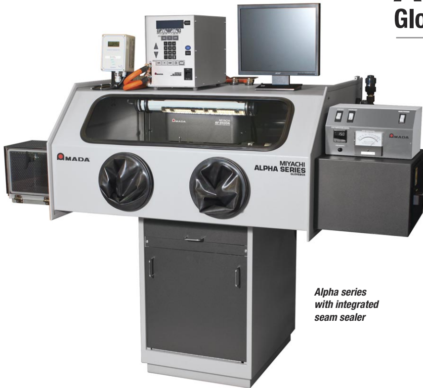
Alpha series with integrated seam sealer

The field proven Alpha Series glovebox systems provide compact and effective platforms for environmental control with excellent price to performance value. The Alpha Series is excellent for both production R&D applications. The glovebox is available in two sizes: one for projection welding applications and the other for seam sealing or general industrial use. Straight-forward controls allow the operator to easily operate oven, vacuum and inert gas backfill controls.