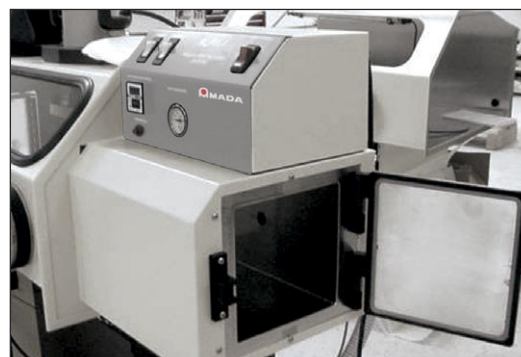
Alpha series optional vacuum bakeout oven