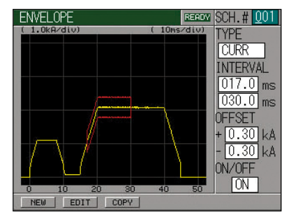
Red: envelope Yellow: current